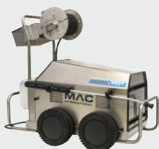
MAC PERMAHOT LASER