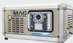
MAC PERMAHOT STATIC