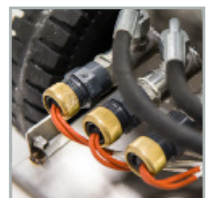
PATENTED HOLLOW ELEMENT SYSTEM