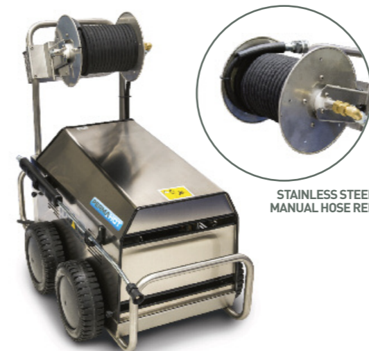
STAINLESS STEEL MANUAL HOSE REEL