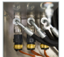
PATENTED HOLLOW ELEMENT SYSTEM