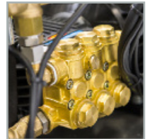
HIGH QUALITY INTERPUMP